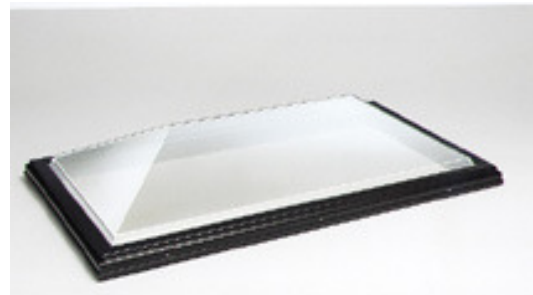
Dayliter Ridgelite VCM